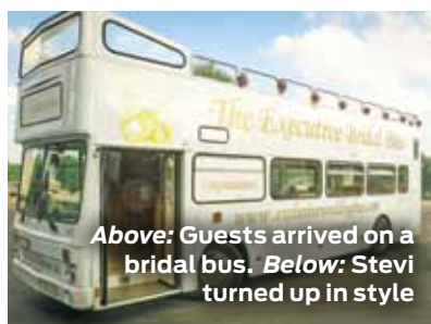
Above: Guests arrived on a bridal bus. Below: Stevi turned up in style