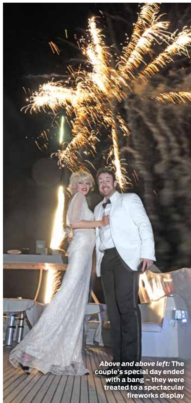
Above and above left: The couple's special day ended with a bang – they were treated to a spectacular fireworks display

TWITTER.COM/KIRSTY_HATCHER PHOTOGRAPHS BY TONY WARD